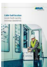
Cable fault location