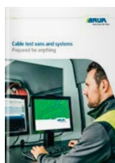
Cable test vans and systems